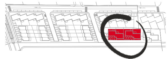
situácia objekt H, I / situation building H, I